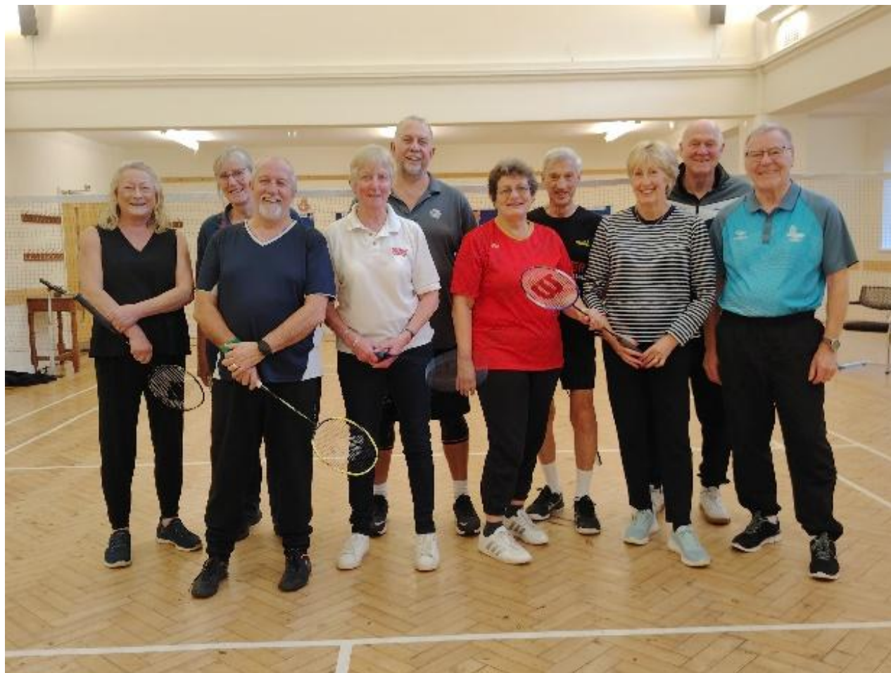
Some of the Friday Feathers members

We have now grown to eleven members, five being non-church members. Standards of play of the new members has grown as they go on. Some members have been playing for a number of years; others have only played in the back garden or haven't played for a few years so needed to clear the rust away. We do not expect players to hit the shuttlecocks every time, even I, who has been playing for nearly 60 years, miss the shuttlecock quite often.