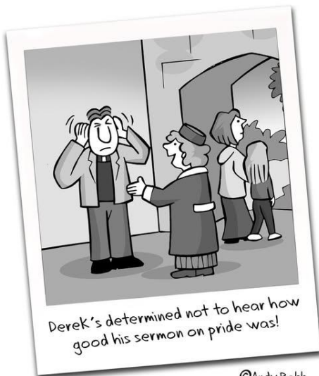
Derek the Cleric