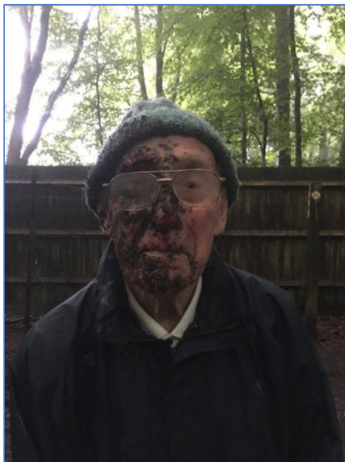
Commando Champion 2024 [Do you recognise this man? 😊 ]