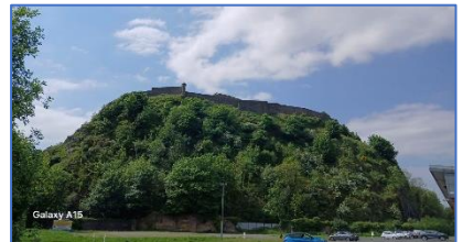
Photo: Dumbarton Castle secure atop of a puy. Puy's are basically the inner core of an extinct volcano, the softer rocks that had enclosed it having worn away. Named, and more commonly found in France. This near impregnable fortress is believed to be the

His day started with a bus to Dumbarton, and from here he walked back the 12 miles to Glasgow. This was largely along the banks of the River Clyde, mainly industrialised.