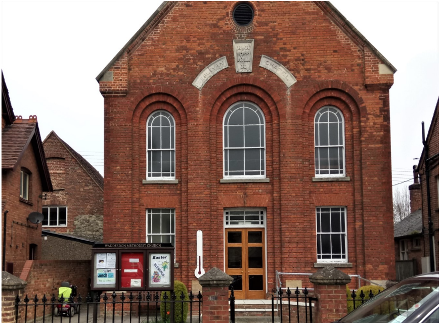
Cover story on pages 8 & 9