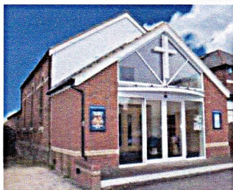
Wycombe Road, Princes Risborough, HP27 0DH