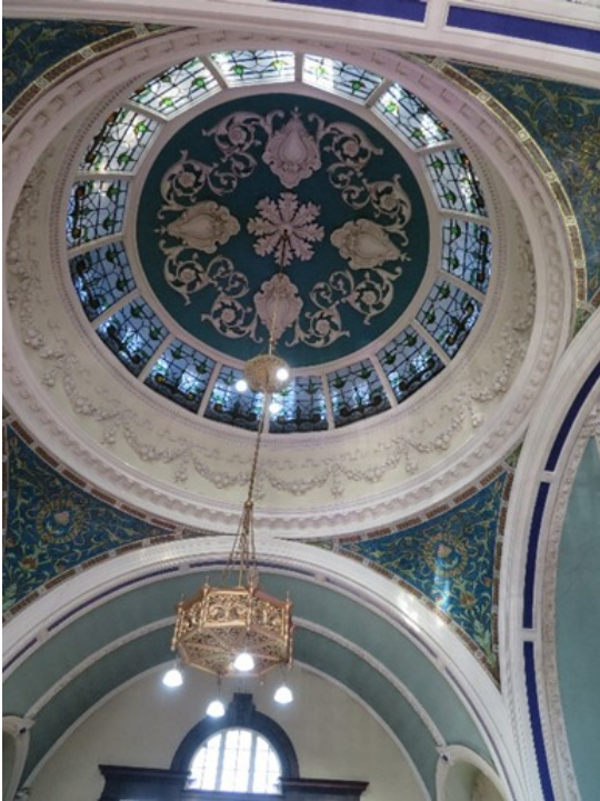
Domed ceiling of Darlington Methodist Church

Darlington Methodist Church is about the same age as Stewkley circ. 1903 but is much larger and with a decorative domed ceiling.