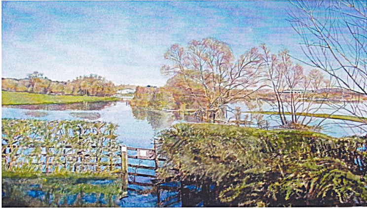
River Thame in flood

at Christchurch, Upper Street, Thame OX9 2DN