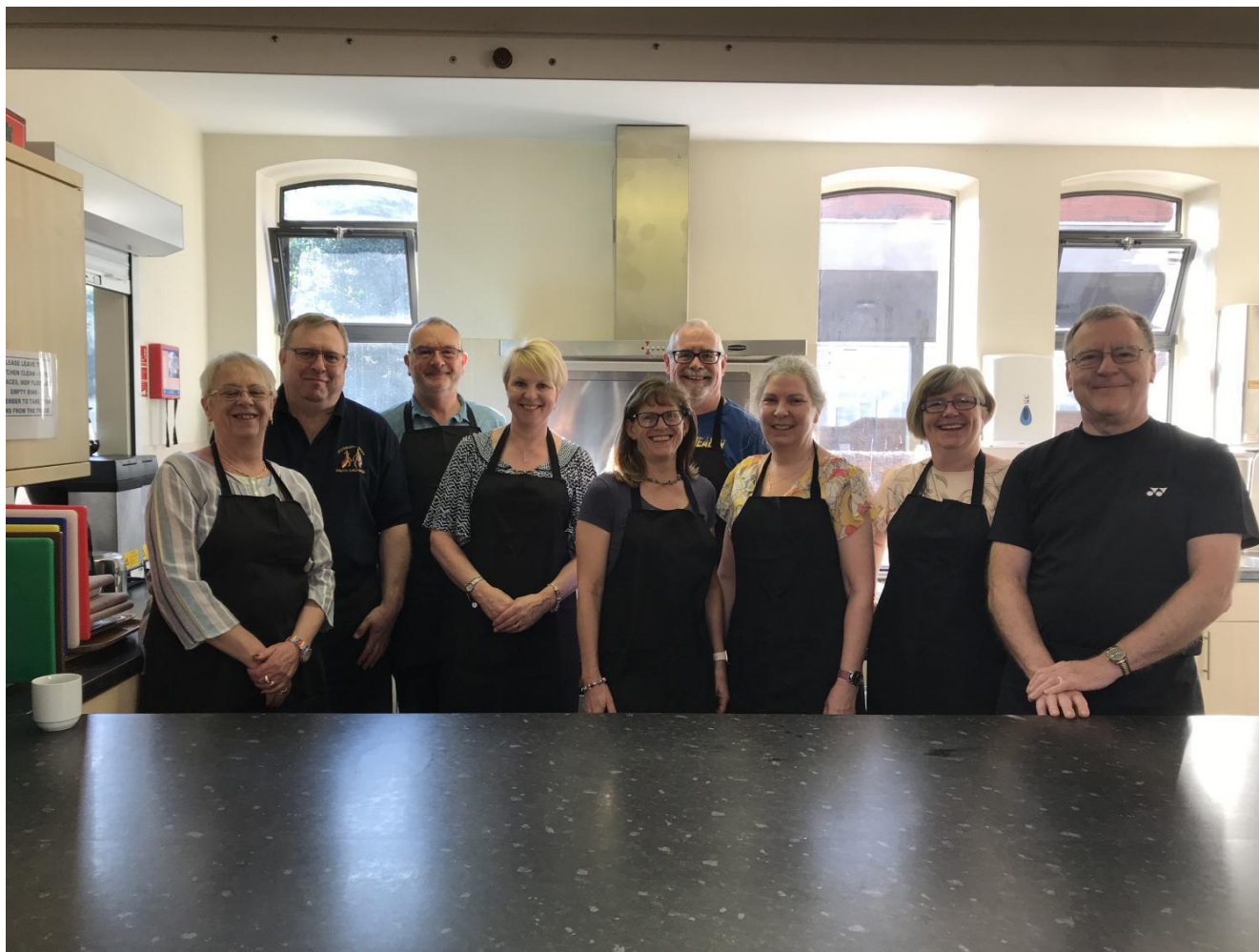
The SOS Full English Easter Breakfast raised £400 for Whitechapel this year

SOS is an informal fellowship group that meets around once a month, usually in someone's home. We take it in turns. Anyone is welcome; just contact the hosts to let them know. Our get togethers always revolve around food; we all bring along a dish to share. For example, this year on one evening we had to create a meal for four people that cost less than £5. We celebrated Diwali with a great selection of delicious Indian food and marked the anniversary of Monty Python's Flying Circus with an interesting array of dishes. Every year we raise funds for the Whitechapel Mission by cooking and serving a full English breakfast before the Easter Sunday service and much more