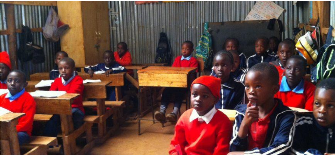
Karibuni children at Limuru Academy

We work closely with the Methodist Church in Kenya who distribute the funds, and the 13 projects are based in Methodist churches in slum areas. They are organized and run by local people: social workers, teachers, cooks and others. The children are from any faith and none and are selected locally by the trained staff with the sole criterion that they should be from 'the poorest of the poor'. Three Trustees visit the projects every year (at their own expense) to discuss the local situation and needs and subsequent budgets and management with the project management teams. We are fortunate to have an experienced Kenyan representative. Inevitably project costs are rising. Our budget for the work in the projects in 2020 is over £250,000.