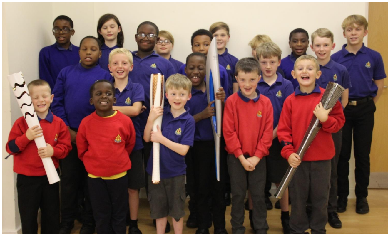
Picture of Paralympic Torches brought by WheelPower

We've had another good year in the Boys' Brigade. Numbers are growing in the younger age groups although keeping hold of the older ones is still difficult as they have so many calls on their time. Unfortunately, no Queen's Badge awards this year but one is in the pipeline.