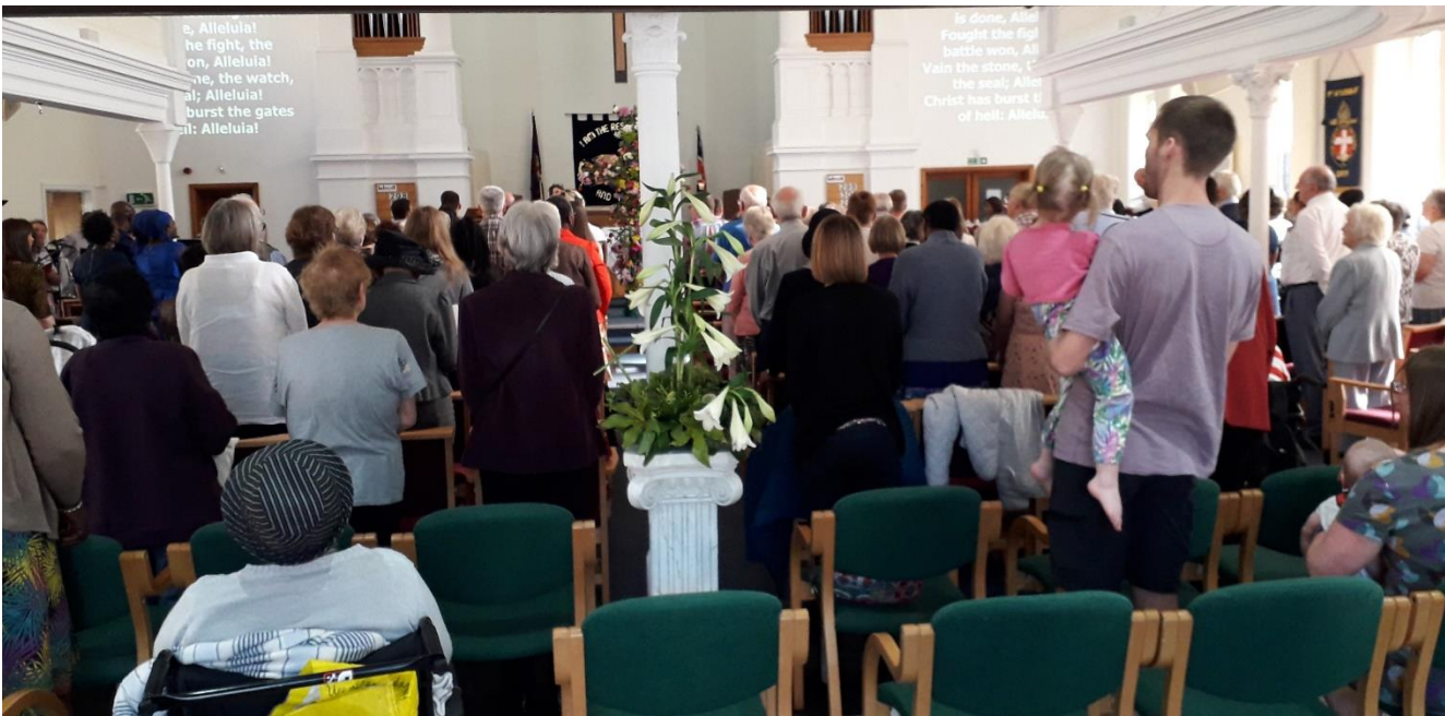
The Easter congregation overflowed into the new Welcome Space, thanks to the new folding glass doors.