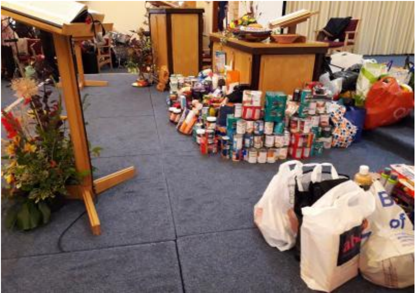
Part of this year's harvest giving for Whitechapel Mission

the work at the mission of feeding, clothing and medical care is much needed among this group of people.