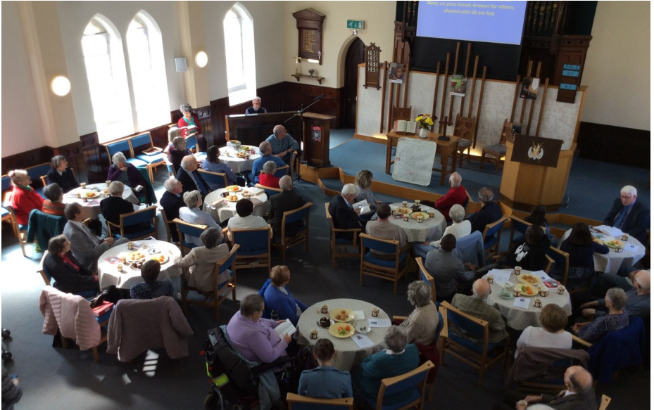
Thame Christchurch Church — see page 8 for cover story