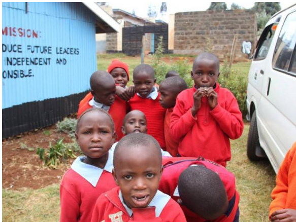
Children at one of the Karibuni projects

Aylesbury Methodist Church has been a major source of support for Karibuni Children over twenty-two years of raising funds to educate and feed some of the poorest children in Kenya – we all wish we could support more of them. Many of you support our events by buying merchandise and making regular donations. The Trustees are grateful for this support.