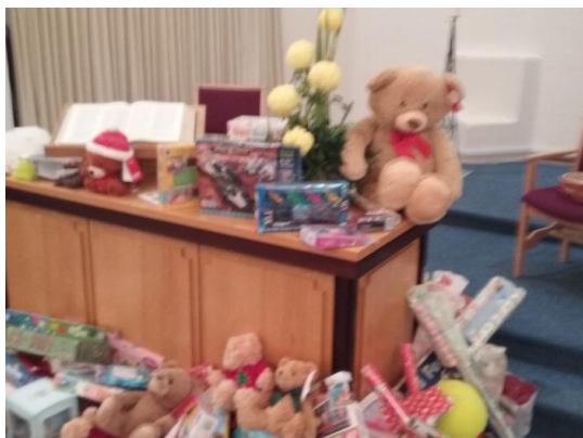
Toy and Gift service December 2017

and on Action for Children Sunday were well supported. Donations included the Tuesday Fellowship and this year we were also fortunate in having some local honey to sell. Home Collecting Boxes are a valuable source of income for the Charity and in the year March to April 18 we raised over £400.