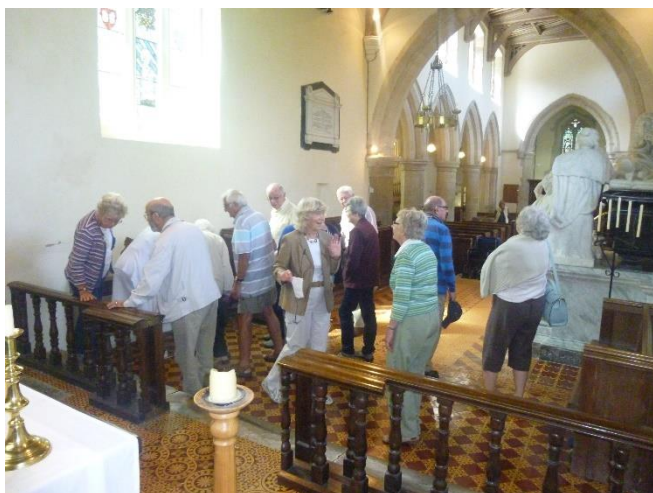
Looking round Drayton Beauchamp church

We had another good year with our number remaining at sixteen. Our meetings during 2018 have been a mixture of meetings in people's homes and trips out. In October last year, the saints came marching in as we each chose and briefly spoke about a saint. After our November planning and social evening, we entered the Christmas Tree Festival and will be doing so again this year. We met in January at the Chiltern Forest Golf Club for our