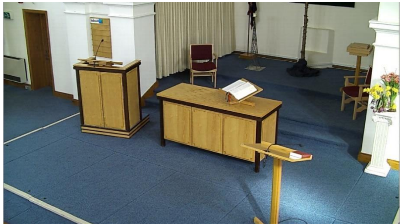
One of the pre-set camera shots for live-streaming our Sunday services