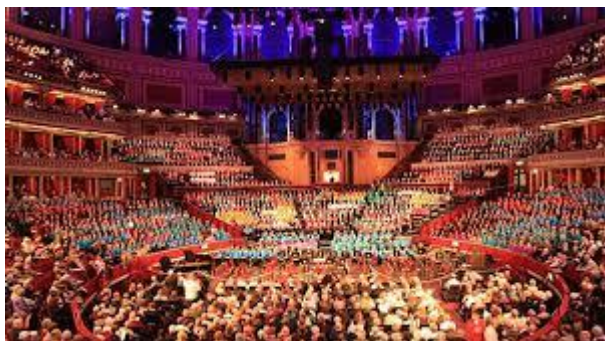
Another enjoyable visit to the Royal Albert Hall

Outings to London can be very expensive, but with membership to the Royal Philharmonic Orchestra's Group bookings we get some 35% discount on their concerts. Last year a full coach of AMC folk and friends thoroughly enjoyed the John Rutter Christmas Celebration in the Royal Albert Hall. This year we are doing the same and a full coach will again enjoy a trip to the capital for this concert and