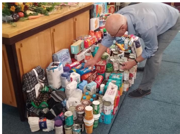
A bumper harvest for Whitechapel

‘Always the homeless first’. The first support we gave to the Mission was the Easter breakfast when the grand sum of £344.50 was raised by a faithful team. This was followed by an absolutely bumper harvest collection; this, with items from Whitchurch and Tring, almost filled the trailer. We were so proud of the generous giving and that folk had mostly heeded the mantra of quantity over quality.