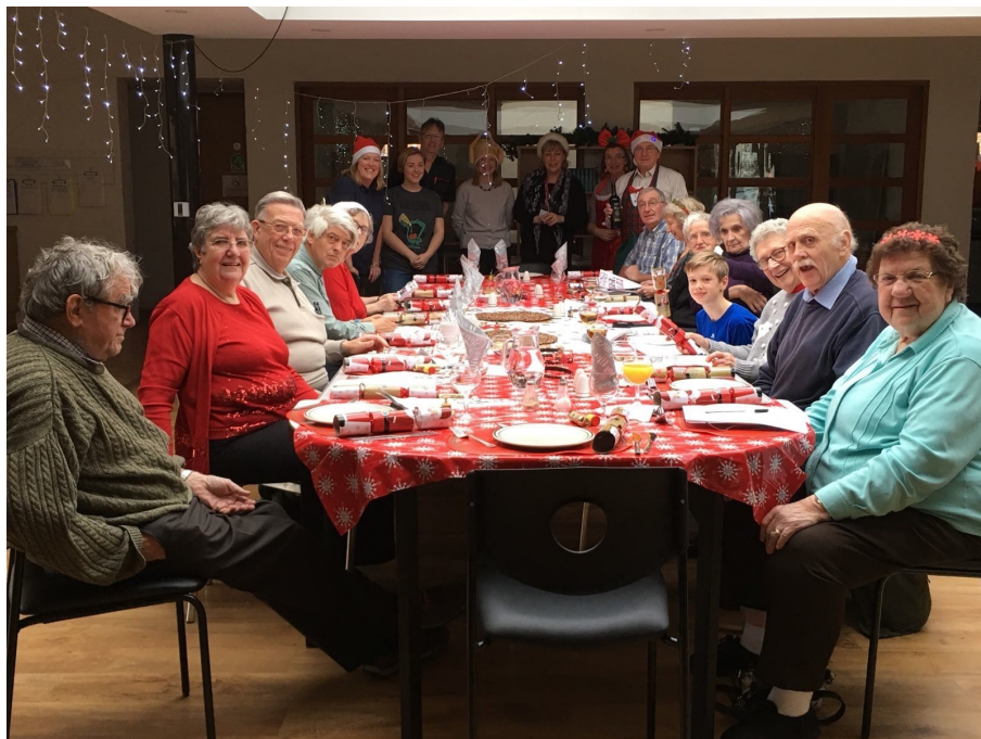
Fairford Leys Church Christmas Lunch—see page 7 for story.