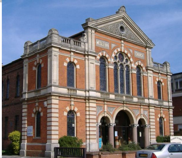
Aylesbury Methodist Church