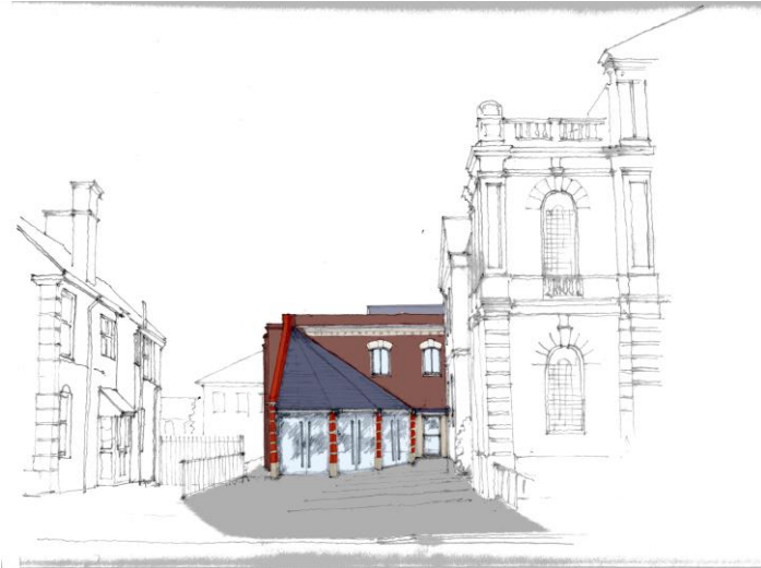
New Community Centre Entrance