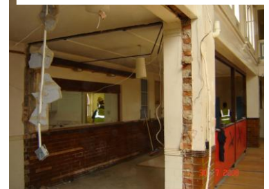
Old coffee bar from hall