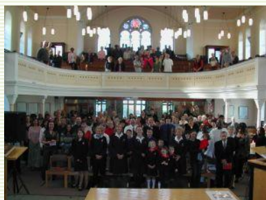
19 countries represented at our One World Week service on 21 October 2007

Actively seeking ways of serving God by serving others