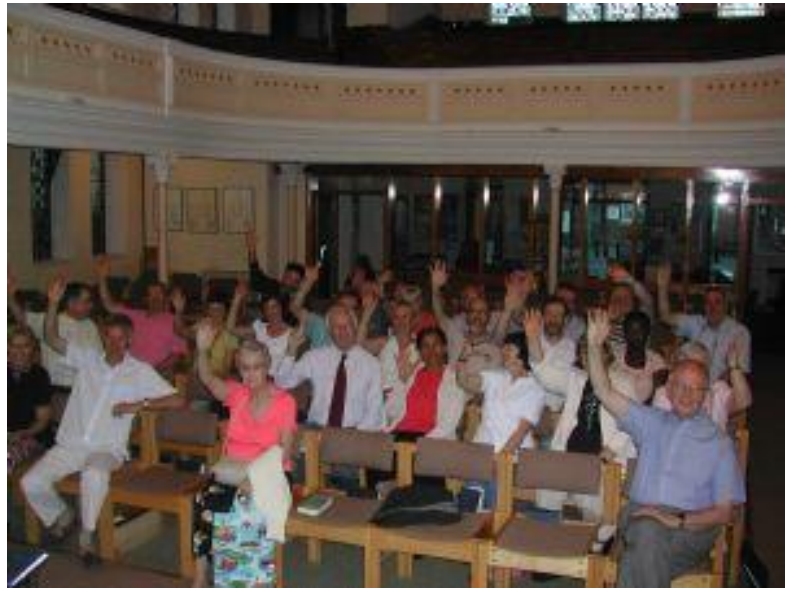
Unanimous approval to go ahead with the building work at the Extraordinary Church Council meeting on 12 th May 2008

By the end of August 2008 they were ahead of target and had raised £75,730.