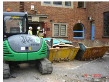
Centre entrance August 2008