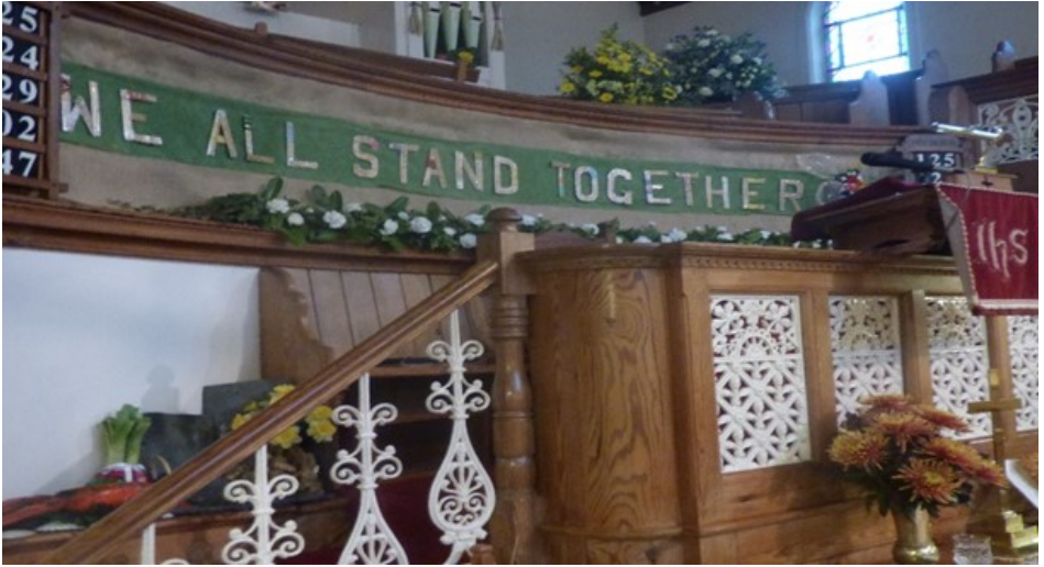
Stewkley Methodist Church—See pages 18 and 19 for story.