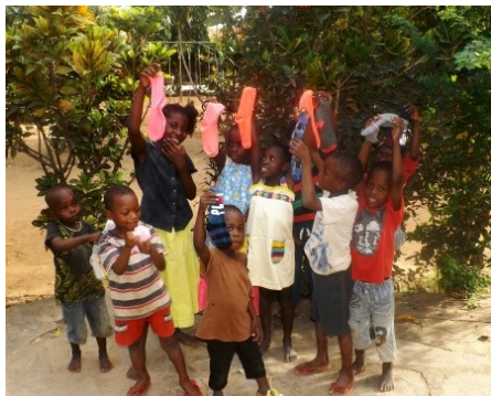
Upendo new socks!

From there we went to Kilifi and visited Upendo where the school and care given continue to be excellent under the new management. The other half of the dresses, skirts and shorts from Princes Risborough were distributed. We visited some families and after lunch left for our short holiday – two nights by the beach at Jumua, a Kenyan churches conference and holiday centre.