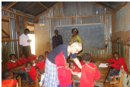
Kawangara class 2

The following day I visited Wesley Empowerment Centre and saw the staff and children (and admired the handiwork of the other half of the work party). This day I was accompanied by the superintendent minister of the circuit and the chair of the project Board, so was very honoured!