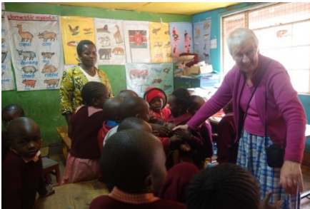
Kawangara class 1