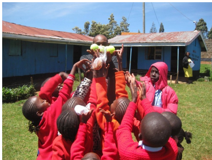
Some of Karibuni's Children in Kenya

do and who we are doing it for, than being a 'Trust'.