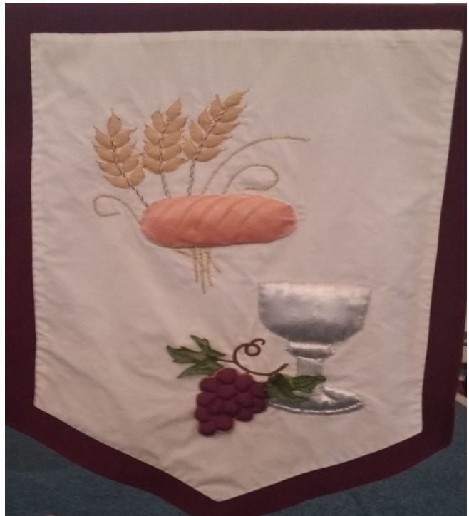
The new lectern communion banner

At the start of the year we completed the 2016 Women's World Day of Prayer banner, which has since toured the churches in Aylesbury. We have started a new banner for the sanctuary area and completed a new