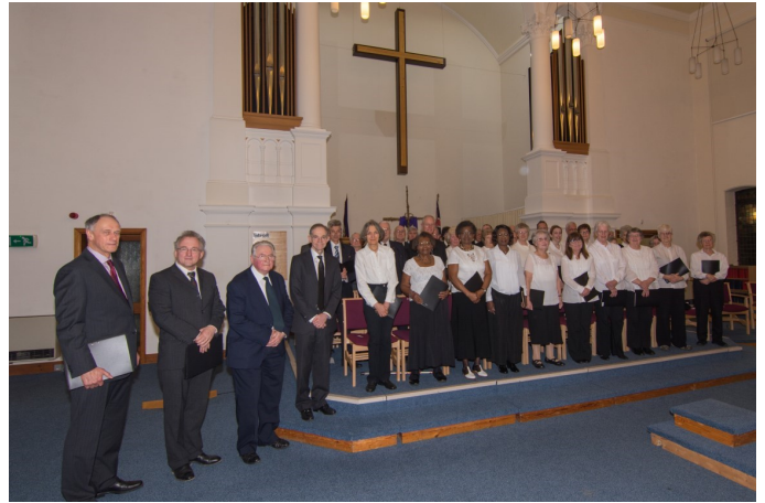
The Circuit Choir with soloists

The Organ and Choir continue to provide their important role, leading music for worship on most Sundays during the year. They were joined by the Music Group and Youth Choir in presenting the annual Carol Service and the Easter Sunday Service, both to packed congregations singing mainly well loved traditional carols and hymns.