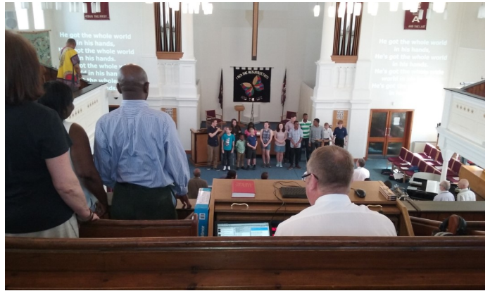
The J Team leading morning worship

Numbers continue to grow and in May, the children and young people prepared and led a Sunday morning service.