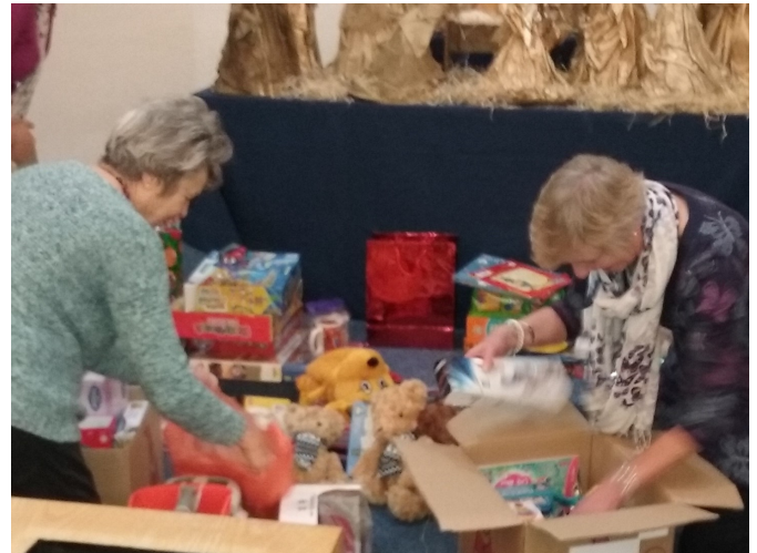
Our annual Gift and Toy Service

We also held our annual stall in the market in July when we ask for donations of cakes, produce and good bric-a-brac, and near to Christmas we held our annual Christmas stall in Friars Square selling items suitable for Christmas presents plus a tombola. Also at Christmas to help raise a little more through "loose change in buckets" we are sometimes lucky enough to be able to find and invite small groups of instrumentalists or singers to perform.