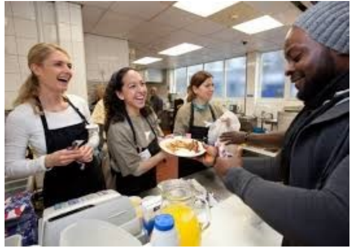
One of the 113,515 breakfasts Whitechapel served to the homeless last year