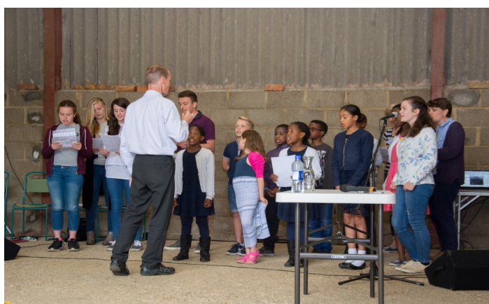
The youth choir at the Circuit barn service

Though small in number, the youngsters involved keep coming to rehearsals. Most have found this a voyage of discovery