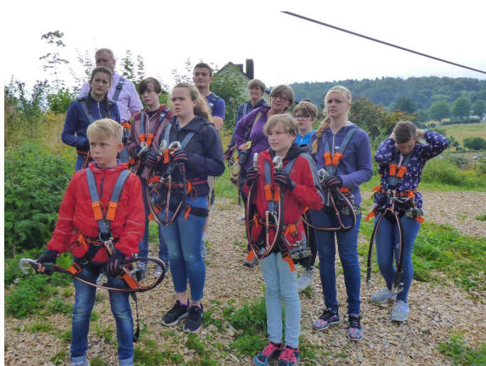
The zip wire training session in Germany

In its 53rd year, the exchange is between youngsters from the Aylesbury area and the TUS Daun sports club in Daun, in the beautiful Eifel area in the West of Germany. This year, at the end of July, we headed off to Germany with 12 youngsters and 3 lead-