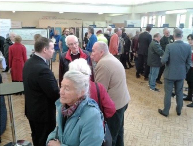
The HS2 public consultation event in the hall

Overall, lettings increased during the year, although one government sponsored organisation ended theirs as a result of the withdrawal of government support.