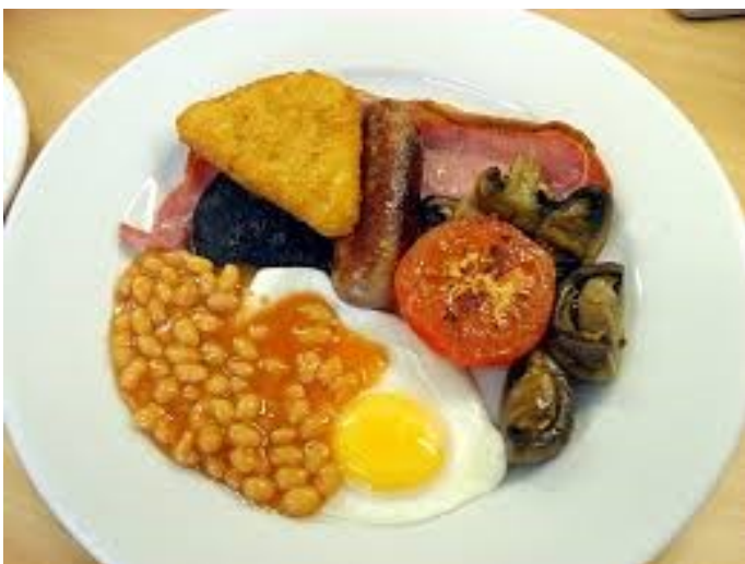
The renowned SOS Easter breakfast

SOS is a social group for any age that meets about once a month for friendship and fellowship. The year's programme is agreed in January where people volunteer their homes and different "themes" are agreed. This year's events included Italian Night, cheese and wine, starters and puddings (mostly revolving around food and drink )