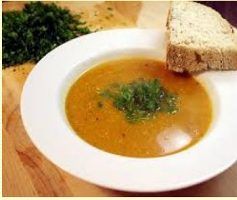
Sociable soup lunches