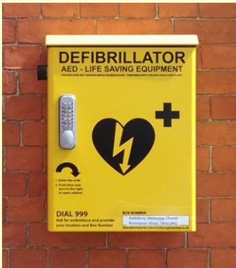
The Defibrillator on the church car park wall