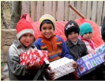
Some happy recipients of the Link to Hope shoeboxes