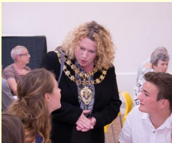
Youth exchange visitor