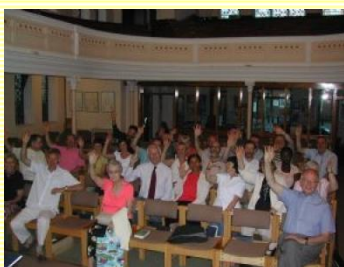
The Church Council is the local decision-making body and the church trustees