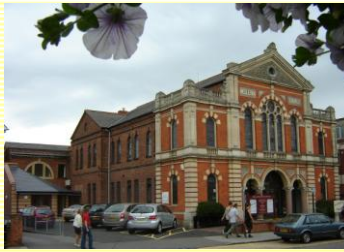
Aylesbury Methodist Church & Centre (AMC), Buckingham St.