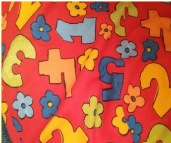
Happy atmosphere at Sunbeams