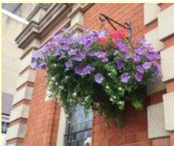
AMC supporting Aylesbury in Bloom

preachers' availability with preaching needs. They offered a very cost-effective, cleaner, fresher and easier-to-use system than our old one. It also gave us a simple means of having a social media presence with the opportunity to engage with people outside the church. Our new website went live at the end of August and the Circuit website will be live by Christmas. This year we will seek to grow awareness of who we are and what we do through our website and social media.