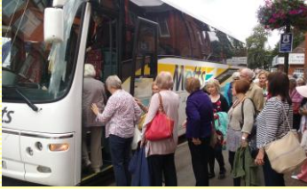
AMC & Friends' coach trips included...