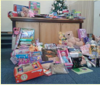
The 'wonderful toys and presents' at the December Toy service...