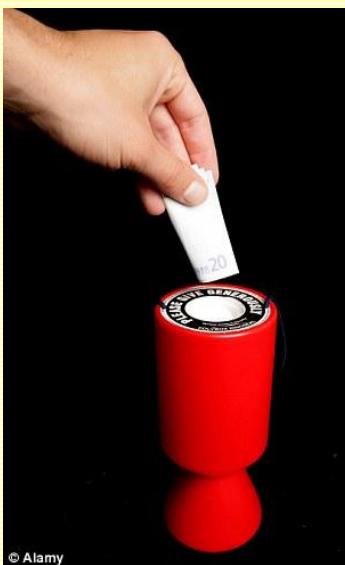
Over £10,000 in cash plus presents, gifts and food were donated by AMC members last year