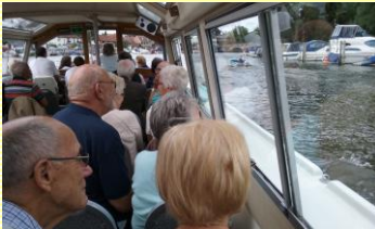
A trip to Henley for a boat trip