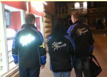
Street Angels in town