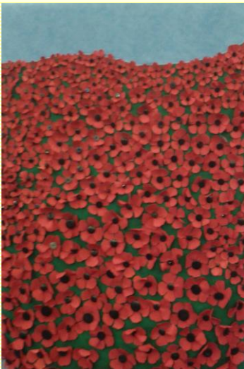
Remembrance Day banner