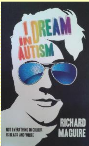
One of the Good Faith Book Club's choices