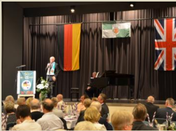
The 50 th anniversary Big Event for 150 in the Daun town hall