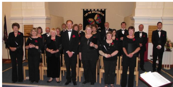
The Wingrave Singers who presented 'Visions of Eternity'