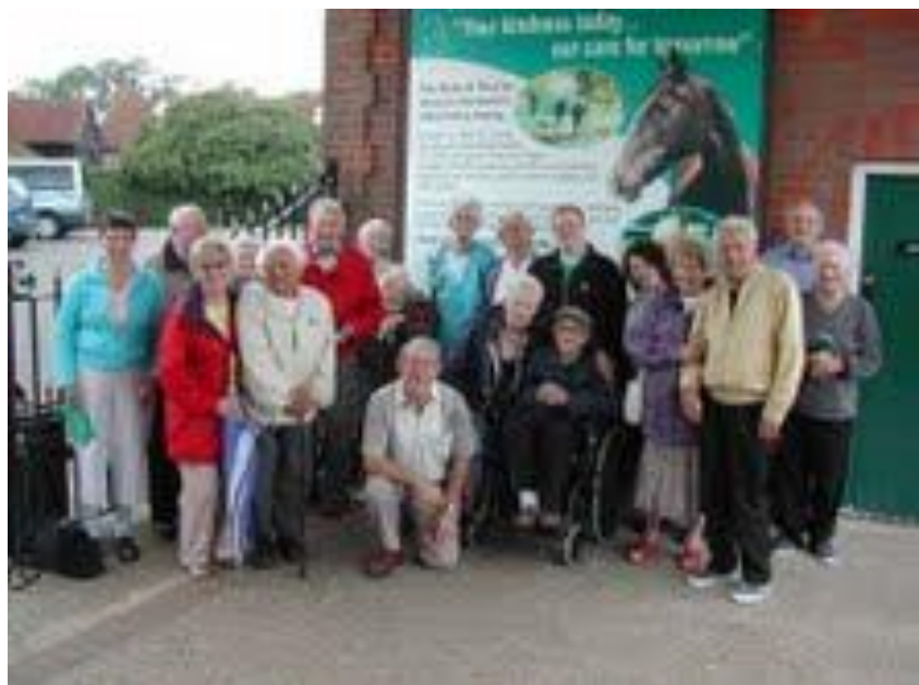
The Wednesday Club, helpers and drivers at the Speen horse sanctuary, its final day out together