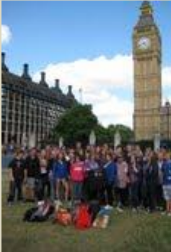
English and German young people celebrate the 50 th anniversary