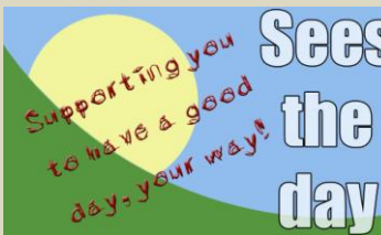
Providing opportunities for adults with mild to moderate learning difficulties

The Wednesday Outreach Day Centre for dementia sufferers moved for charity status to St John Ambulance, ending 20 years association with this church