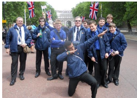
Usain Bolt Mall practice?