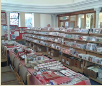
Cards for Good Causes raising funds for multi-charities – one of our many long-term clients