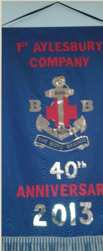
The Boys' Brigades new banner made by The Banner Group